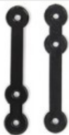
Composè 3 per completi Modello a Fettuccia