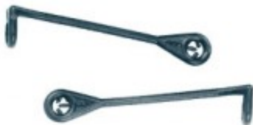
Composè 2 per completi Modello a Bastoncino